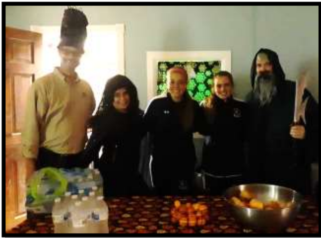
Bridge of Peace "Trunk or Treat" & POP Table