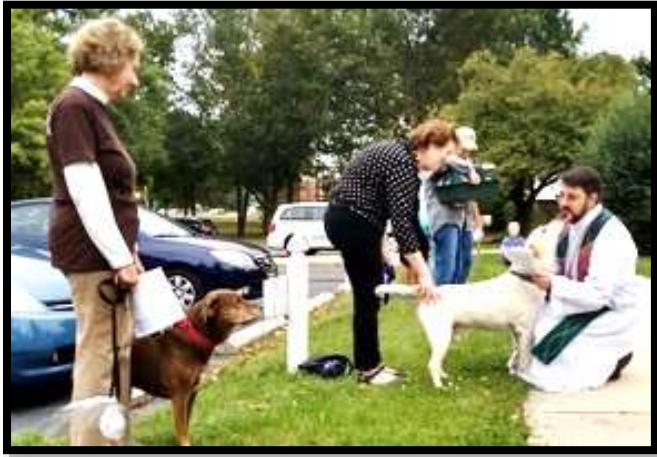
Community Pet Blessing