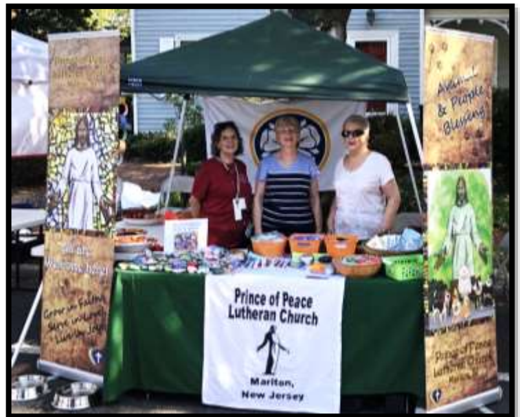
POP Table at the Evesham Harvest Fest