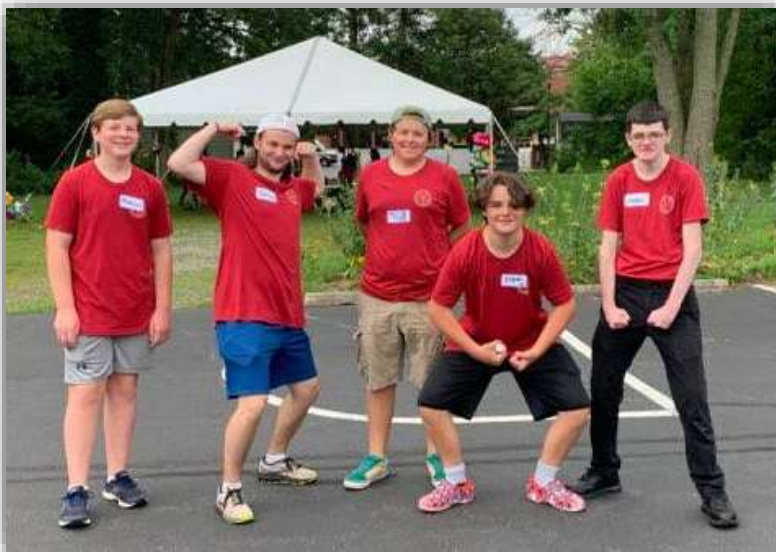
Youth Volunteers for Vacation Bible School.