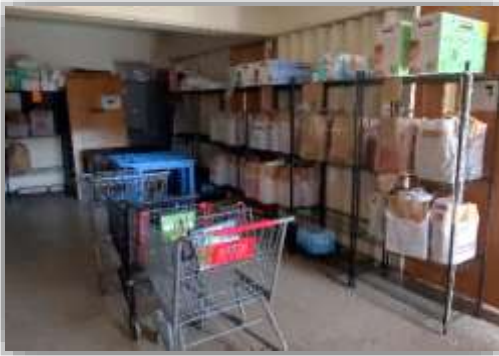
New Pantry Shelves

"I cannot say enough wonderful things about the POP Property Folks. They are always available to help take care of any issues or needs we may have. Their response to our needs are always immediate and prompt.