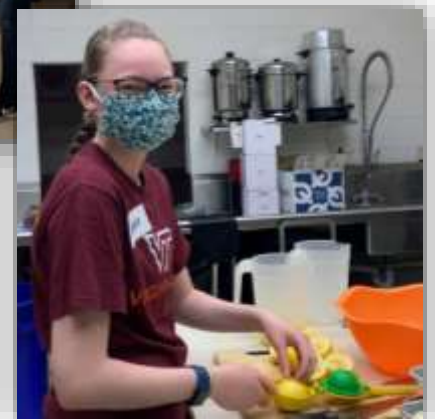
Vacation Bible School Kitchen Helper