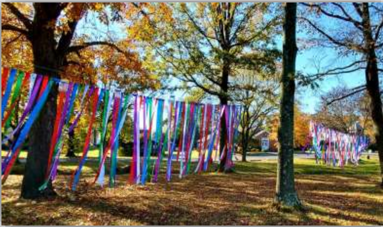
All Saints' Honor Display on Route 70