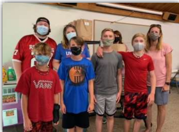
Youth Volunteers for the POP Pantry.