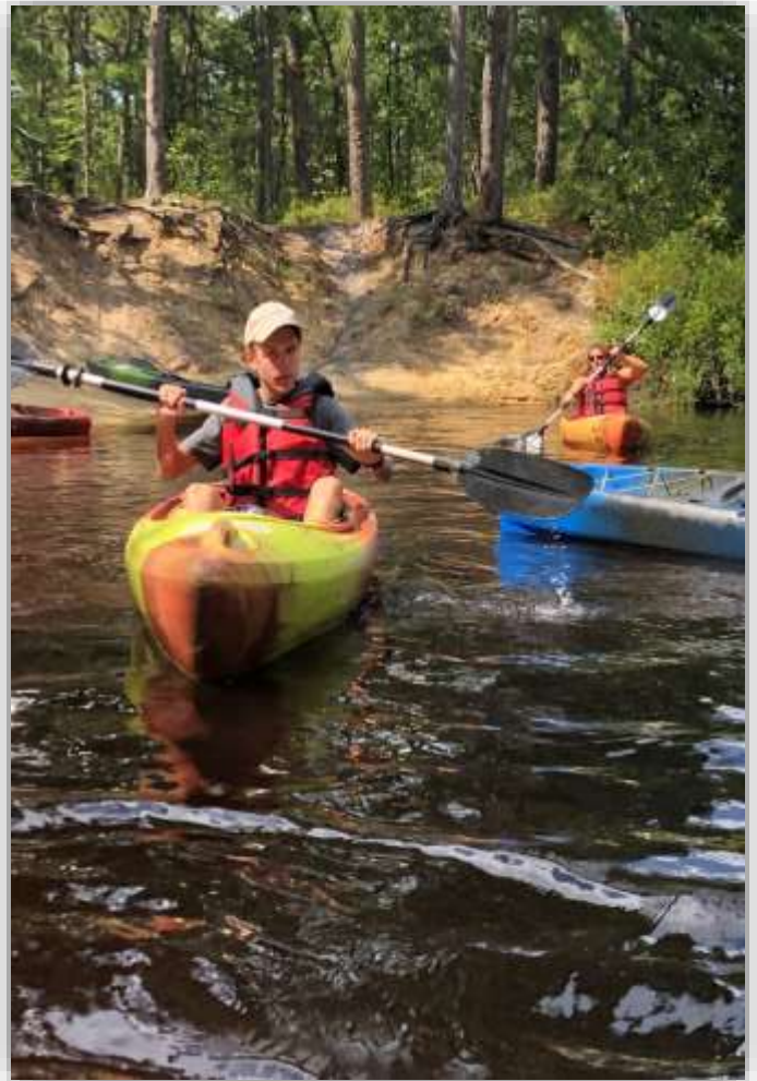
Youth Kayak Trip.