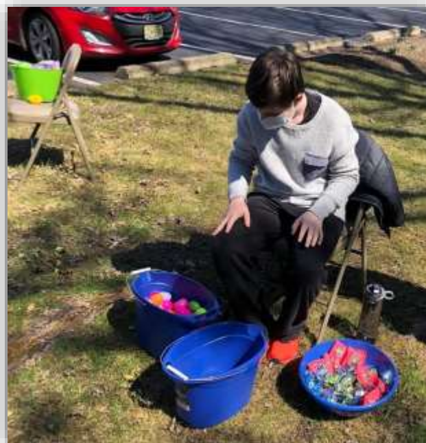
Youth volunteer helping fill the eggs for the Egg Hunt.