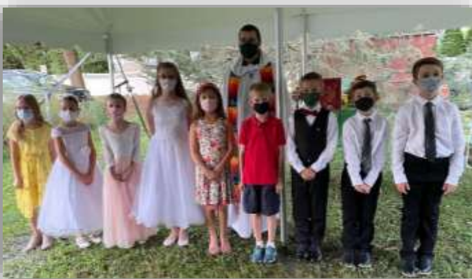
First Communion Service