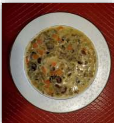
Soup Delivery - thanks Sharon Elliott!