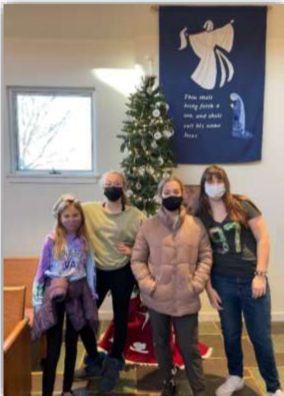
Youth Decorating the Sanctuary for Christmas.