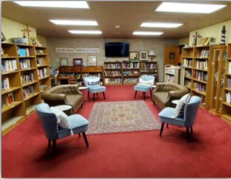
Klos Library Renovation