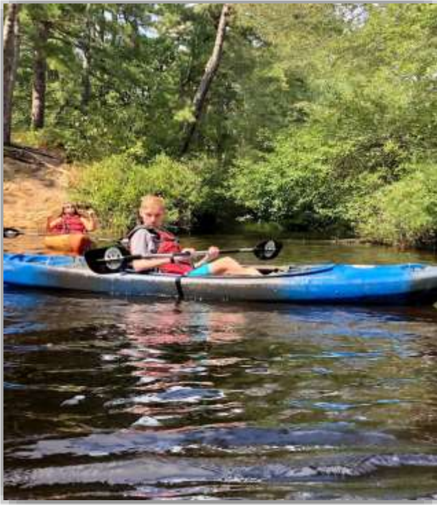
Youth Kayak Trip.