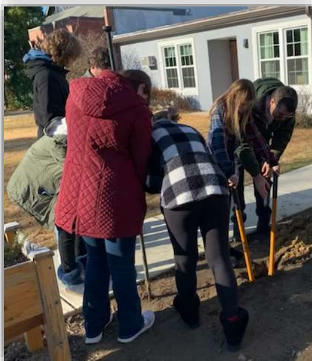
Youth Volunteers helping construct the POP Little Library.