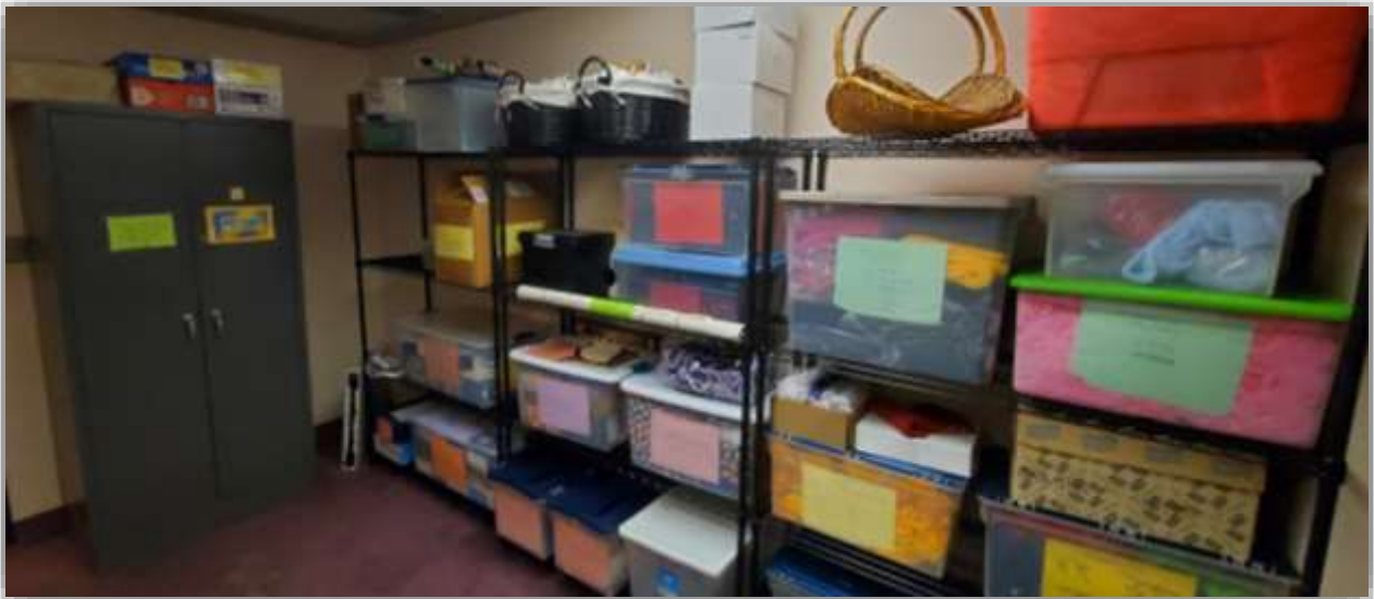
Side Office (Property Office) new shelving and organizing.