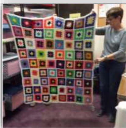
Joseph Blanket Ministry.