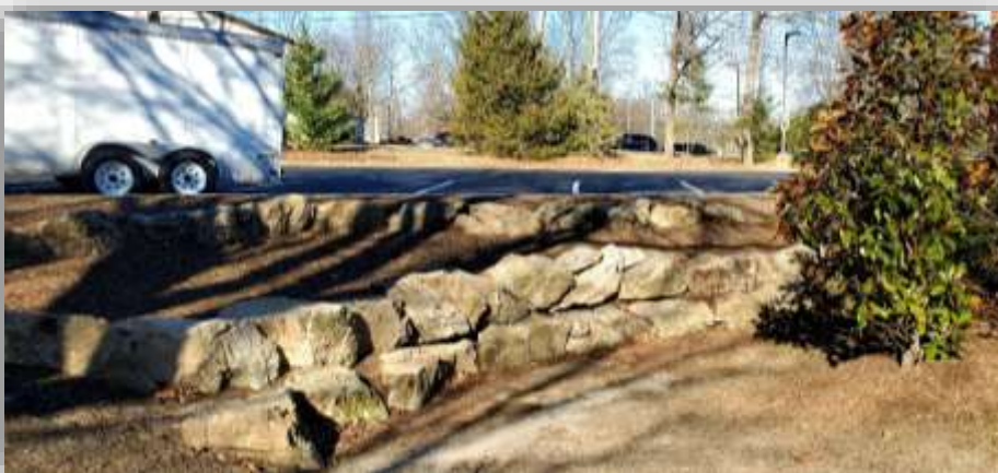
Rock Retaining Wall 2021