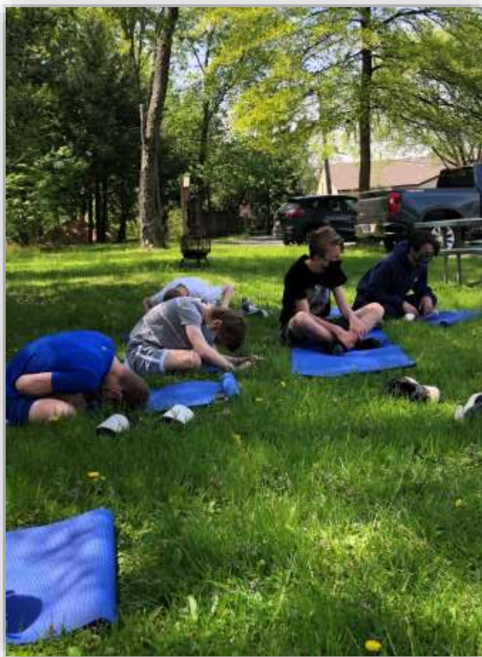
Youth exploring mind and body spirituality.