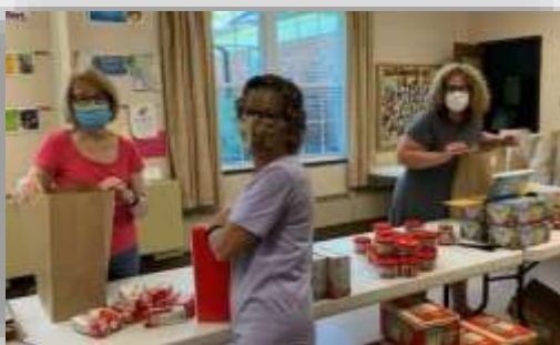
Summer Meal Packing