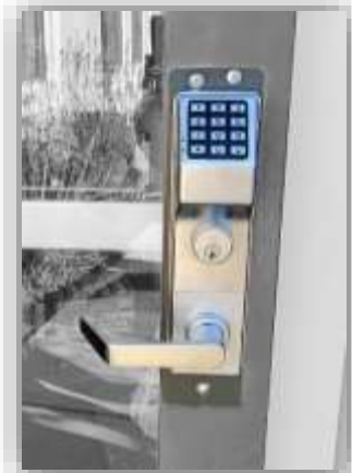
Pantry Combo Lock