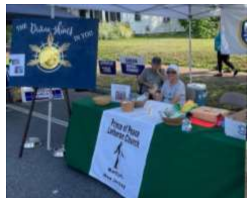
POP Booth at Evesham Harvest Festival