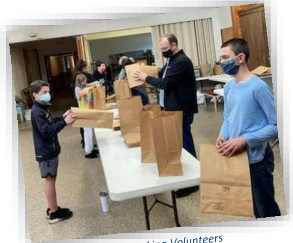
Food Packing Volunteers

"The Food Pantry is set up to help those who are in need, sometimes not just for food. Sometimes the volunteers are offering toothbrushes, feminine products and even a shoulder to lean on when it seems the world can be a very tough place. I haven't been helping long in this ministry, but I can tell the caring and concern evident in everyone from the people who pick the items and load up the bags to the people who greet those in the community coming to receive those bags.