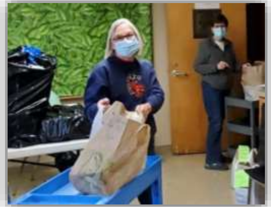
Thanksgiving Basket Packing

"This year, life at work got very busy and I had to step away from helping out at POP. Mid-summer, my spirit felt off kilter and after thoughtful prayer, I realized it was because I wasn't connected in any of our ministry work. I reached out to the food pantry folks, and they quickly got me into the volunteer rotation. From the first night back on the schedule, my heart knew this was exactly where I was to be. I felt such a loving connection with our guests; they lifted me with their friendly welcome as we chatted in the parking lot. I am thankful that our church and community is so compassionate and that we do our best to feed our neighbors in the most loving way we can.