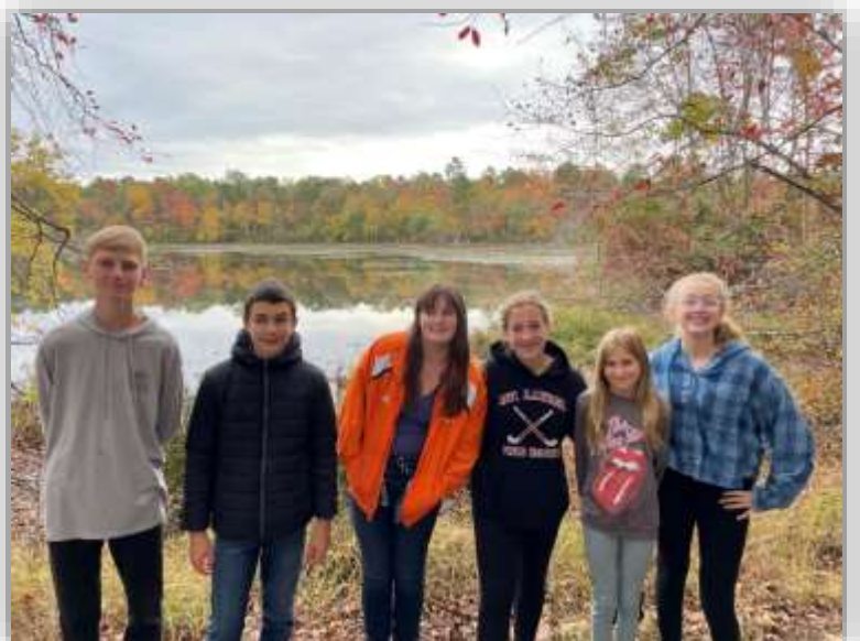
Confirmation Class in the Black Run Preserve.