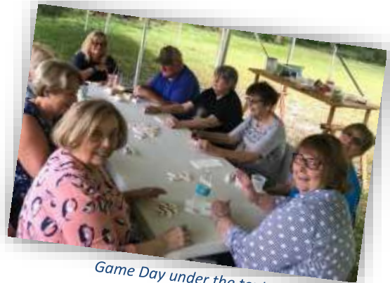
Game Day under the tent.