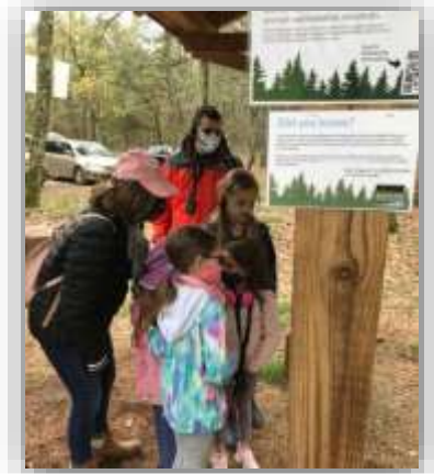
Discipleship Practice at Black Run Preserve