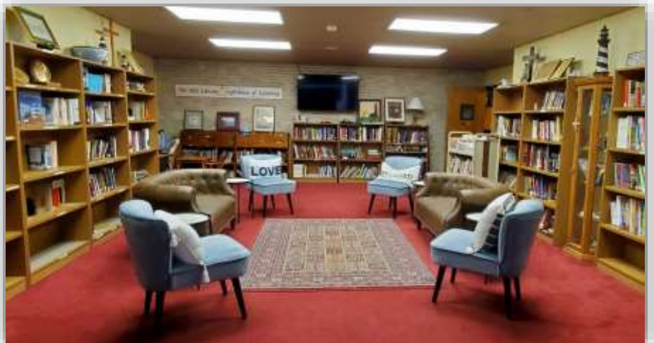
The Klos Library Renovation – 2021