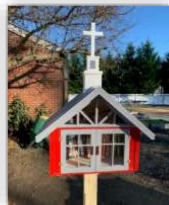
POP Little Library & Volunteers.