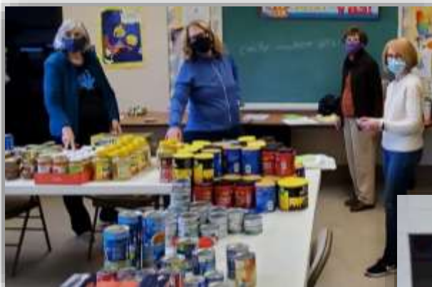
Social Missions Food Basket Helpers