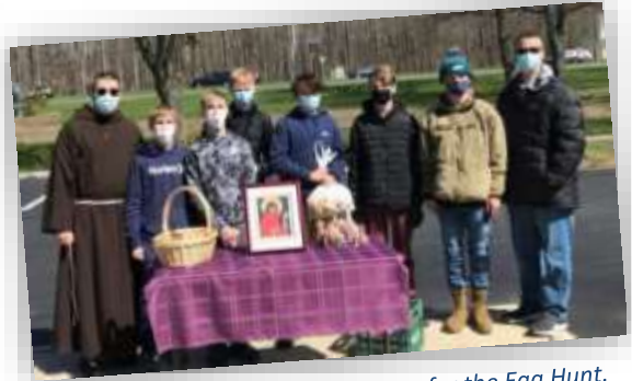
Confirmation Class helped prepare for the Egg Hunt.

Hopefully, 2022 will allow us to once again have our Community Picnic in the Spring along with an outdoor movie night.