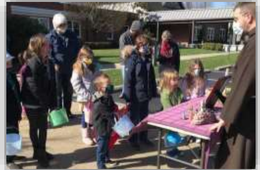
Church family & Community Egg Hunt.