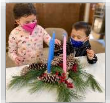
Advent Wreath Making