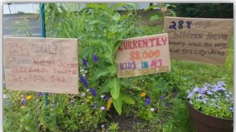
The Youth group stayed overnight behind POP to raise awareness for homelessness. They raised more than $400 dollars for Family Promise.