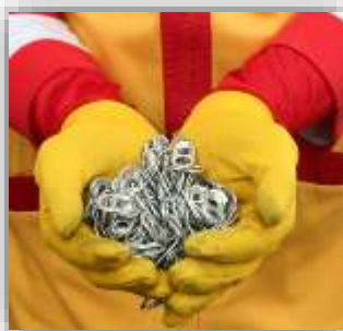
Soda Pop Tabs for Ronald McDonald House