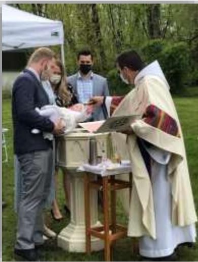
Outdoor Baptism Service