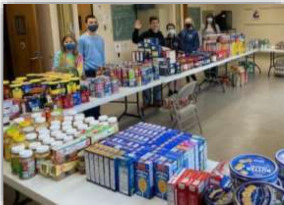
Holiday Basket Packing