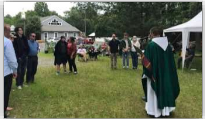
Blanket Blessing Service