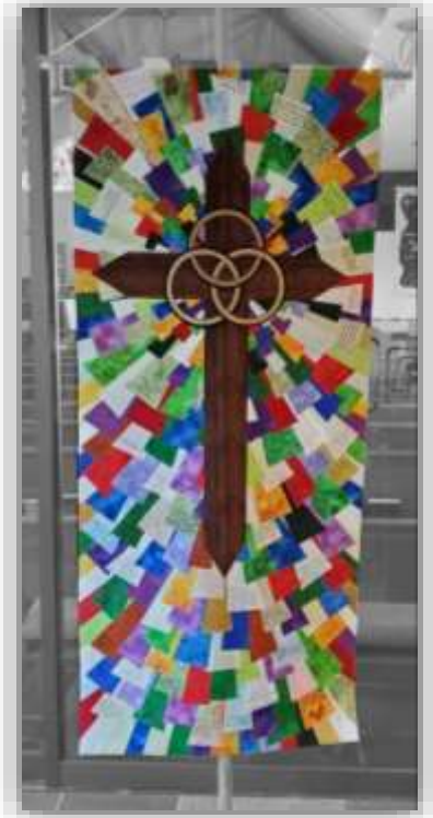
Lenten Art Project 2021