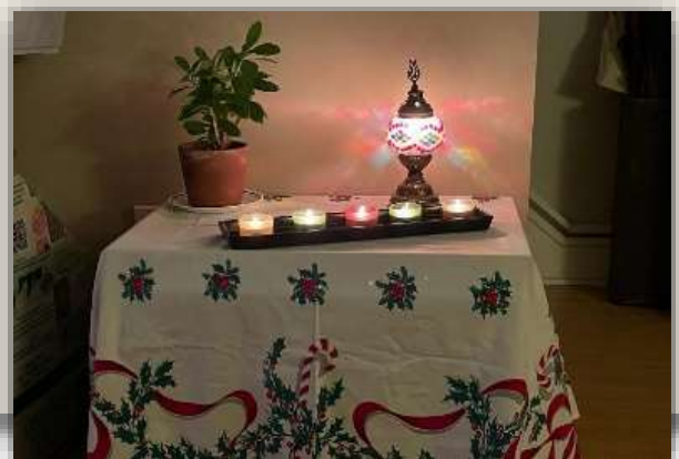
At Home Worship Area