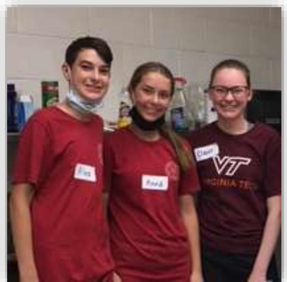
Youth Volunteers for VBS Food Duty.