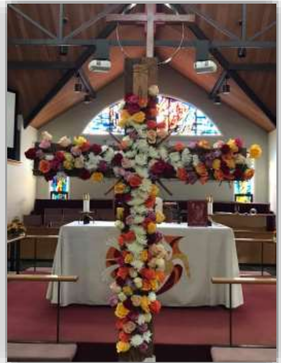
All Saints' Cross

"Our family celebrated many happy occasions at POP. I can't say enough about the ministry and the people there. When it came to grieving for my husband, thankfully Prince of Peace was there for me with the gift of love and caring when I needed it the most."